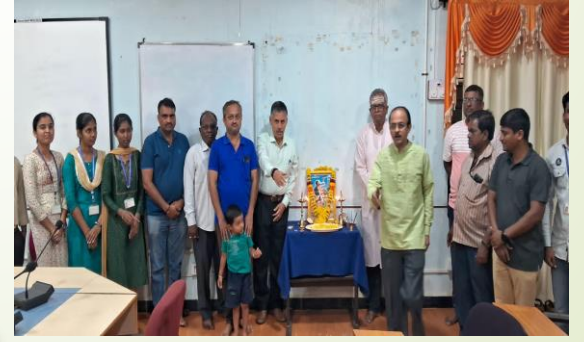
Kanakadas Jayanti celebrated in CMDR